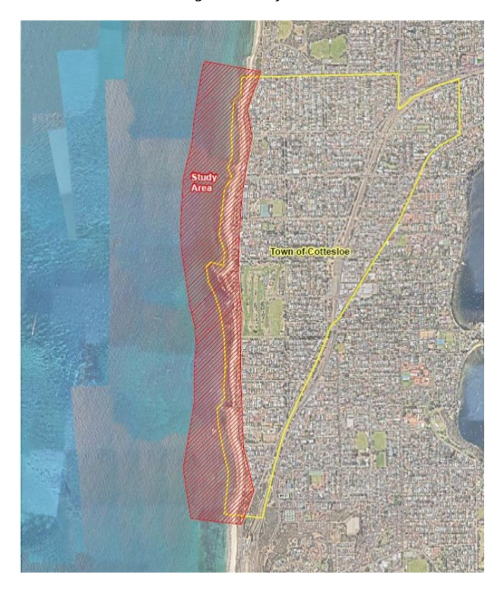
Figure 1: Study area

This CSEP provides an outline of community and stakeholder activities as well as communication methods, that will assist the technical team to prepare a CHRMAP for the project site.