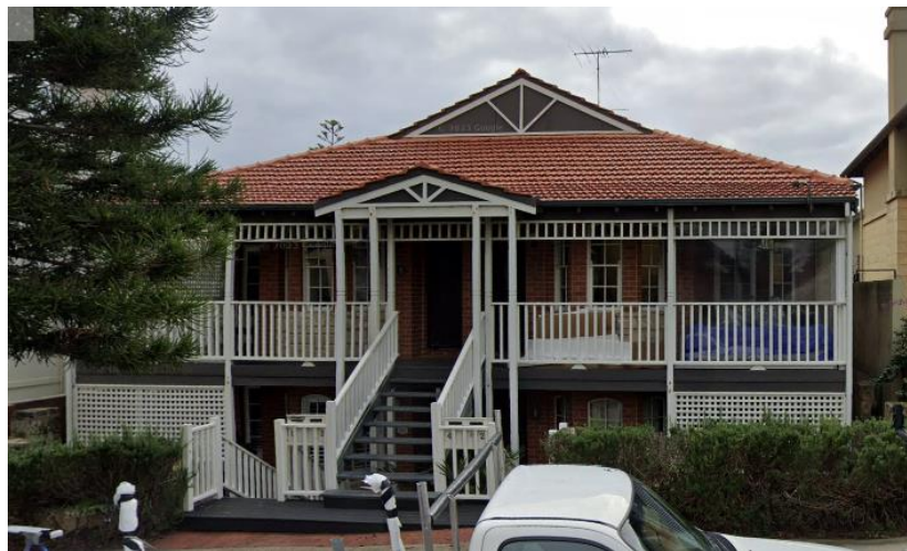
Above: Street view