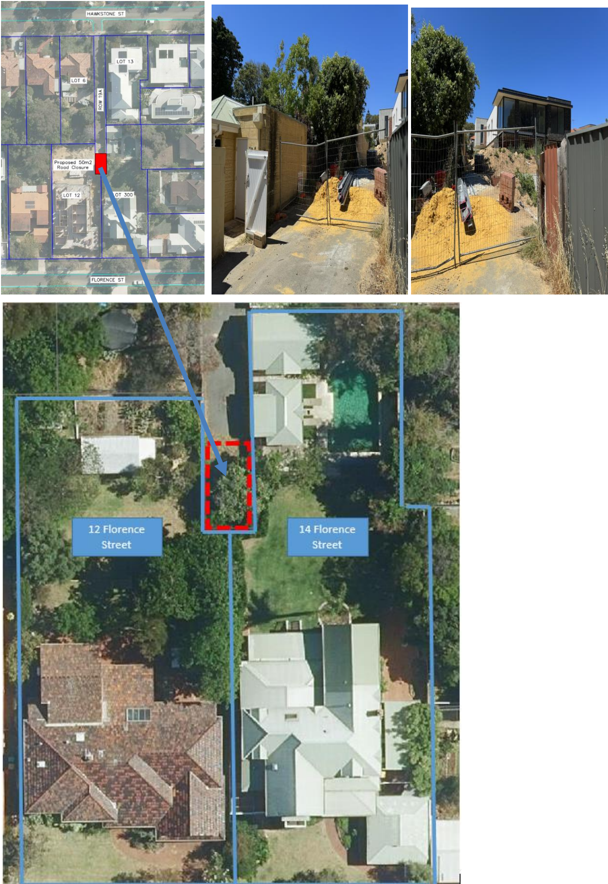
Figure 2: Location plan and photographs of proposed 50m 2 Road Closure