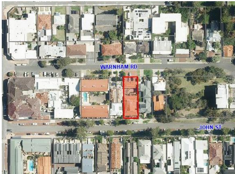
Above: Aerial photograph of site