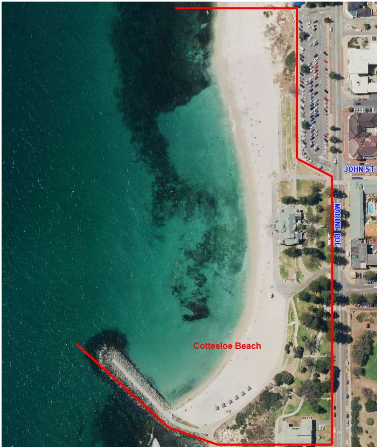
Cottesloe Beach – Groyne to the grassed terraces north of Indiana and west of Car park 1.