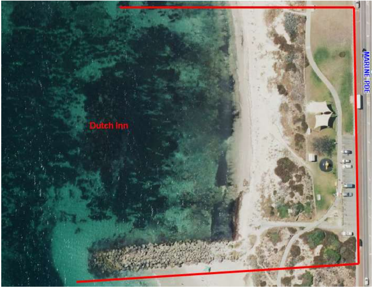
Southern groyne to just north of the children's playground