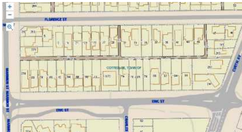
Figure 1: Right Of Way 21

Right Of Way 21 runs between Marmion Street and Curtin Avenue. Homes on Florence Street, Eric Street, Marmion Street and Curtin Avenue back onto Right Of Way 21. Please refer to the below image.