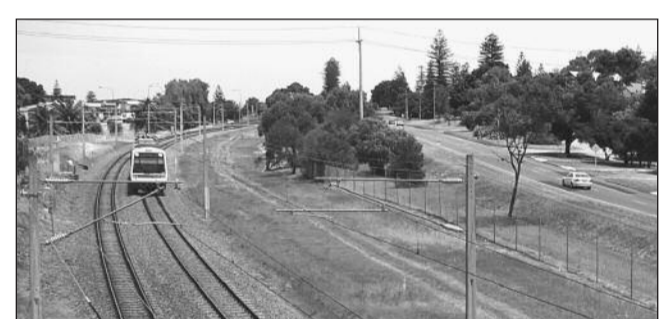
Curtin Avenue and railway lands will be discussed.

During the evenings of the workshops there will also be