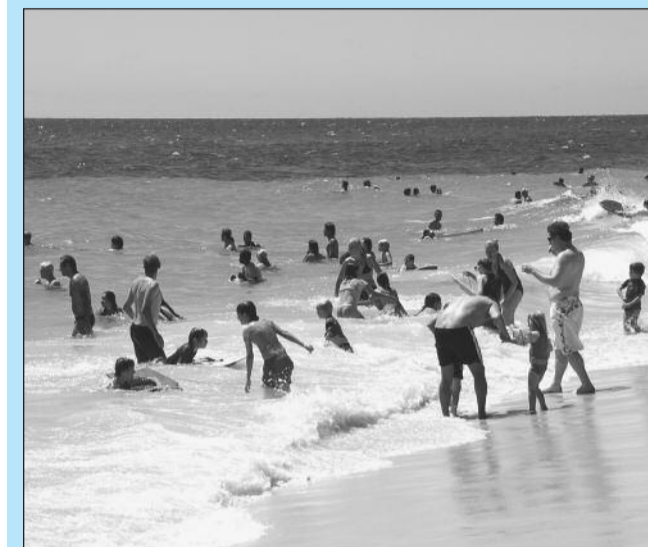
Thousands of swimmers are expected at Cottesloe Beach.

COUNCIL has sanctioned an attempt on a world record this month by up to 4,000 swimmers.