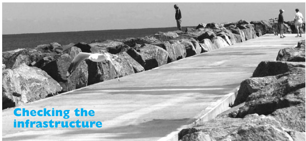
Checking the infrastructure

• Explore making the Cott News page available to readers by direct email.