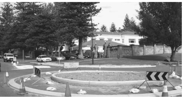
Newly-built roundabout near the Civic Centre aims to improve the Broome Street Black Spot.

"The trend towards a wider range of outlets where families can enjoy a drink in pleasant, civilised surroundings is likely to grow," he said. "There are other applications in the wings, and they are likely to be approved also.'