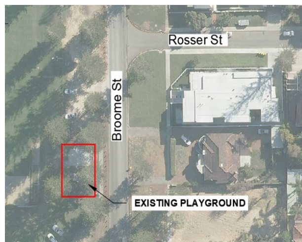
Figure 1: Existing Playground Area

Harvey Field is located along Broome Street and is bound by the Sea View Golf Club to the west. The existing playground location and facilities are presented below.