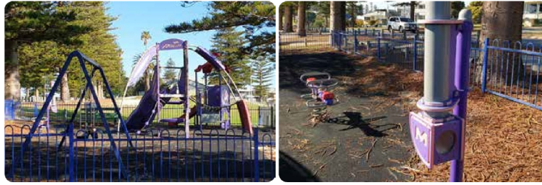
Figure 2: Existing Facilities (Dual-seat swing, play forts, spring seat, periscope)

The working group is asked to discuss and provide the consultant feedback on: