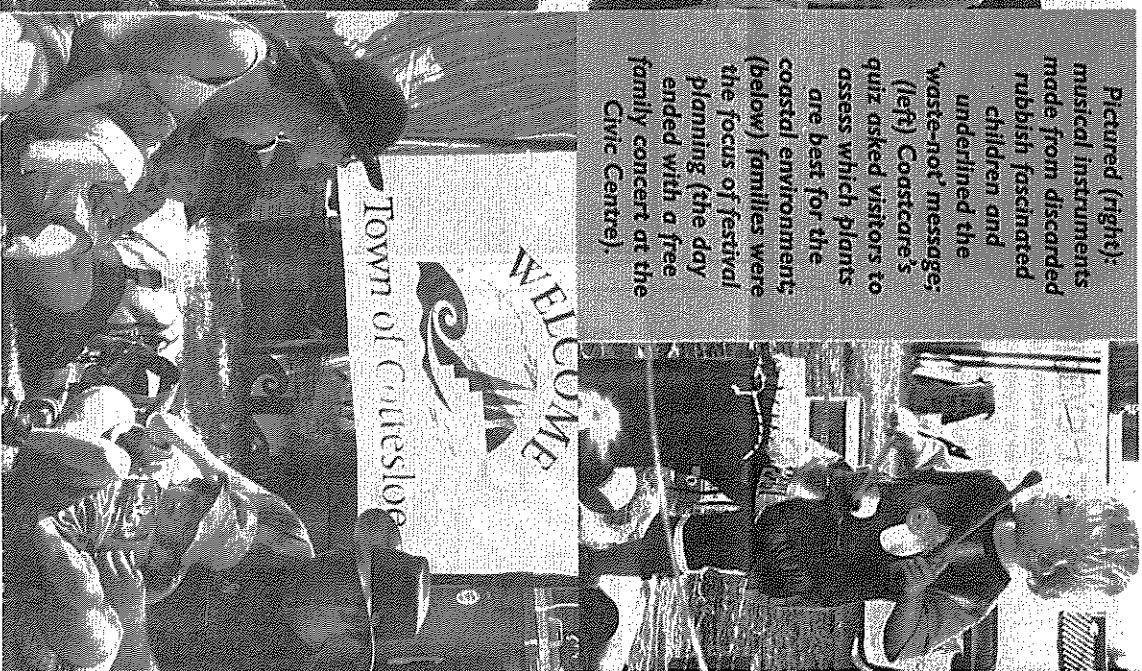
Pictured (right): musical instruments made from discarded rubbish fascinated children and underlined the 'waste-not' message; (left) Coastcare's quiz asked visitors to assess which plants are best for the coastal environment; (below) families were the focus of festival planning (the day ended with a free family concert at the Civic Centre).