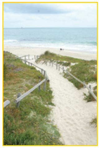
■ Beach access paths – $132,760

This is the first of five allocations to be made over the next five years to restore beach access paths, a project to be undertaken in consultation with Coast Care. Paths in greatest need will be replaced first. Detailed plans will be made available later this year with construction likely in April 2016.