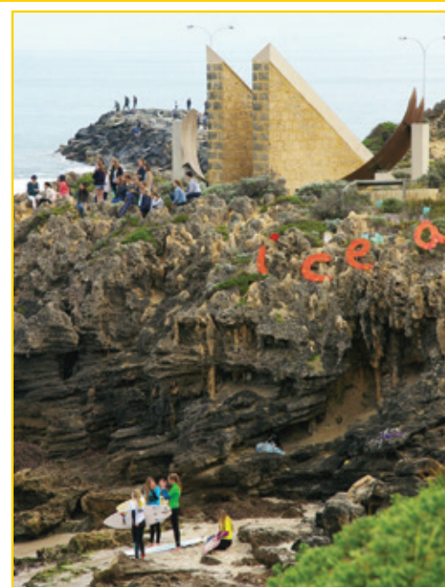
ICEA is one beneficiary of the Town's community grants programme, with a grant to help pay for a marquee at the annual surfing and awareness event at Cove Reef.