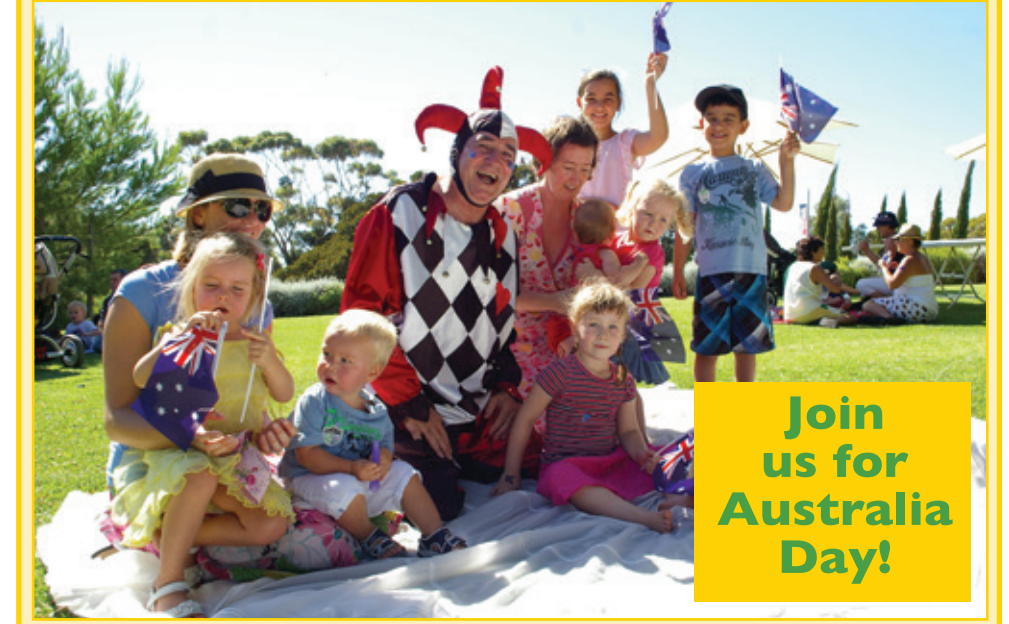
IT'S a wonderful way to enhance your Australia Day, in the company of citizens old and new!

NEXT Council meeting Monday December 15, at 7pm. 2 leetings – see below