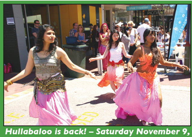
9am-5pm in Napoleon Street.

'However you can take some comfort from the fact that coastal planning now has at least paid some lip-service to some of the factors that epitomise the Enquiry by Design process and outcome. I think the future for this council is to get those principles refined and applied on the beachfront, when development does occur.