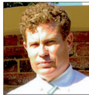
Mayor Kevin Morgan

Full details of the initiative, the letters of communi-