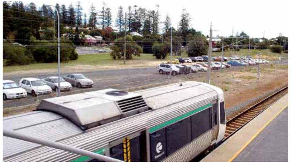
Parking solution: This area, between the rail line and Curtin Avenue, will have 75 new, all-day parking bays courtesy of the Public Transport Authority. It's anticipated the area will take commuter pressure off the Grant St median strip.

"It's far too soon to assess the trend of the submissions, but it's fair to say that for many people, living in Cottesloe and elsewhere, the proposed major modifications by the WA Planning Commission and the Minister for Planning give rise to significant concerns about the approach they are taking to the future of the beachfront and other parts of the district."