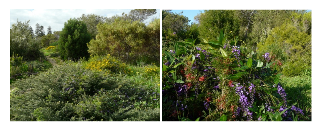
The same area at Cottesloe Native Garden in July 2014