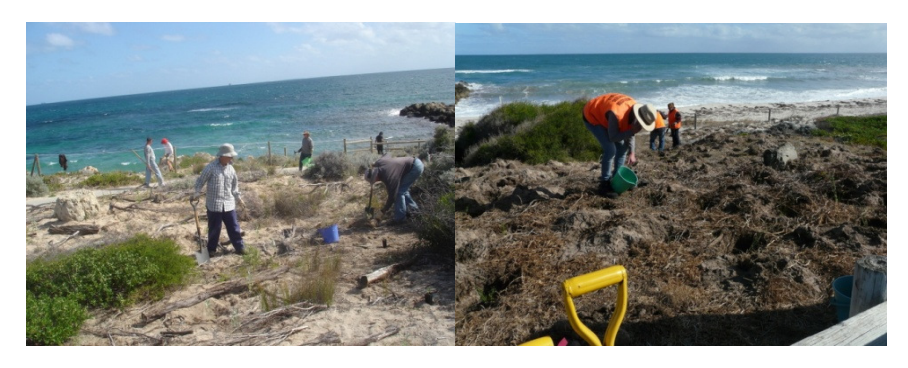
(L) planting south of Dutch Inn groyne 2008 (R) planting north of Dutch Inn groyne 2014

In 2012 Town of Cottesloe built a weed barrier between the playground lawns and the top of the narrow (weed infested) fore dune on the north side of Dutch Inn groyne. Woody weeds were removed in early 2014. Couch, pelargonium and sea spinach were sprayed in Oct 2013 and again in May 2014. CCA volunteers planted 600 plants on this dune in June 2014.