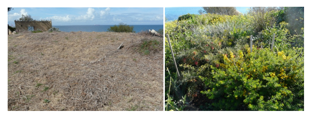
Mudurup Rocks 2009

Staff from Synergy and from Coca Cola assisted with planting and weeding. Quintilian and Hale School students also joined in planting sessions.