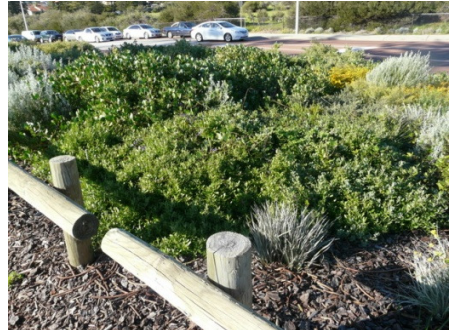
Mudurup rocks verge - new fence and weeds sprayed - (R) same site 2012