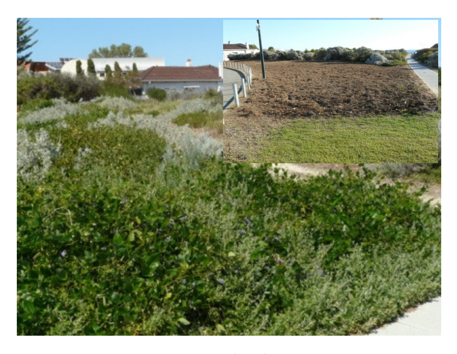
Eastern side of Grant Marine Park 2009 (inset) and 2012