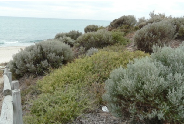
2007 removing Victorian Tea Tree