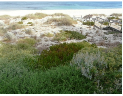
Photo (L) sea spinach and tea tree 2011. Photo (R) new ramp on north side with local plant species establishing - 2012