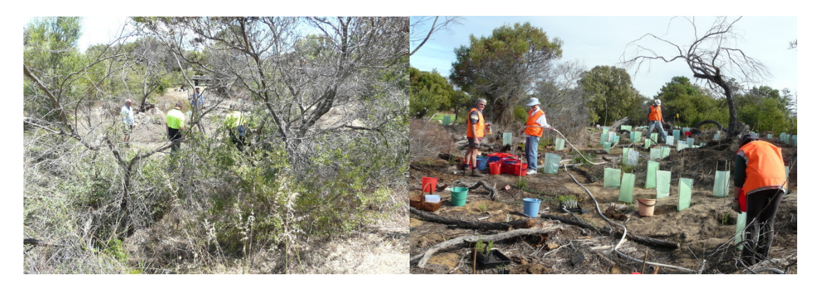
(L) Victorian tea tree being removed 2009 (R) CCA volunteers planting (same site) 2009

Revegetation – Since 2009 - each year CCA has planted approximately 500 native seedlings, using local provenance seed, collected and cleaned by CCA. Many species are specific only to this one natural area in Cottesloe – including Lechenaultia linariodes, Scaevola anchusifolia and Xanthorrhoea preissii.