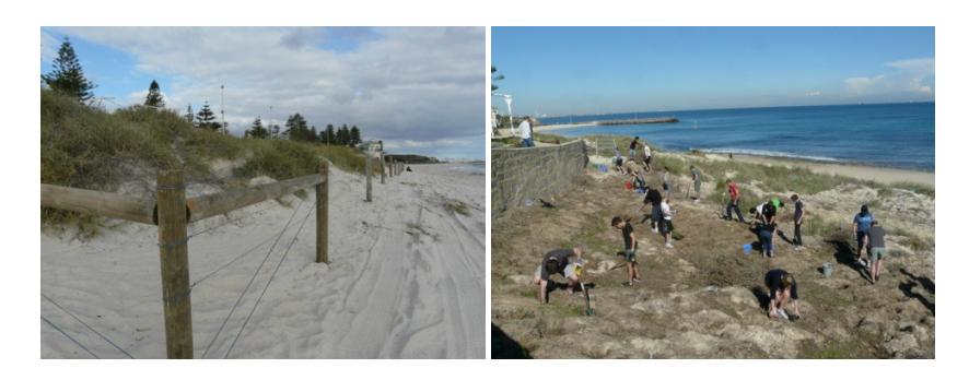
Photo (L) new fence. Photo (R) volunteers planting at Napier St foredune 2011