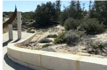
(L) - Quintilian students planting. (R) limestone retaining wall