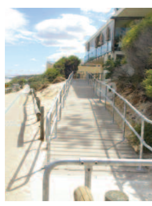
Recently installed ramp for access to North Cott toilets below Barchetta restaurant