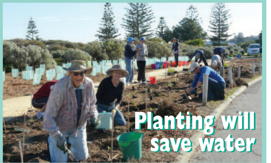
Planting will save water

AREA 3 Put out your waste on September 19 (collection - September 21 on.)