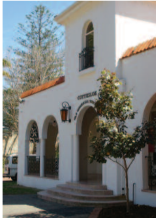
Civic Centre – 'must be preserved'

Works and Corporate Services – Tuesday September 20, 7pm.