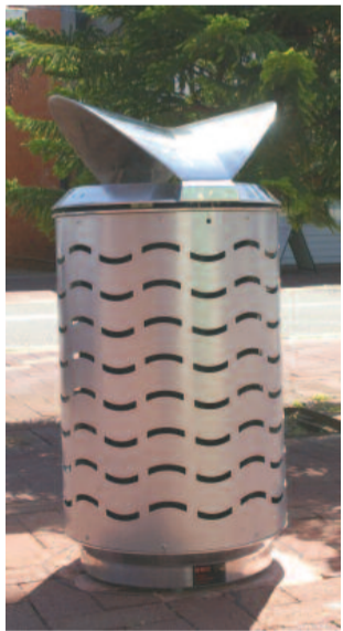
Ready for all weathers, the new Monsoon bins.

But they have welcomed this kind of 'Monsoon' – it being the name of the smart new gleaming stainless steel litter bins the Town has used to replace the unsightly old ones. So when you go to the Hullabaloo – make good use of the Monsoon.