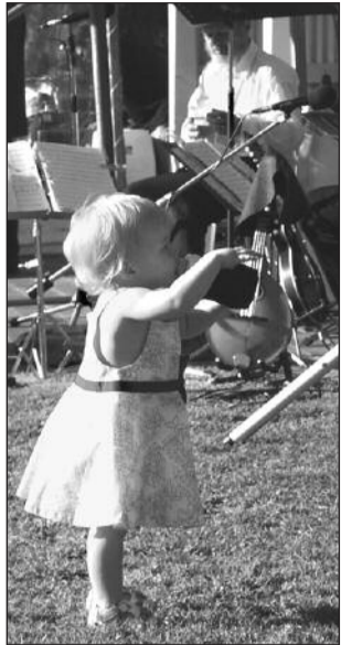
There's something for everyone on Australia Day, though some prefer the musicians to the speeches!

COTTESLOE'S Australia Day Awards will be presented on Saturday, January 26 at joint community celebrations hosted this year by Cottesloe. Every year the Town combines with the Shire of Peppermint Grove and the Town of Mosman Park for a celebration breakfast.